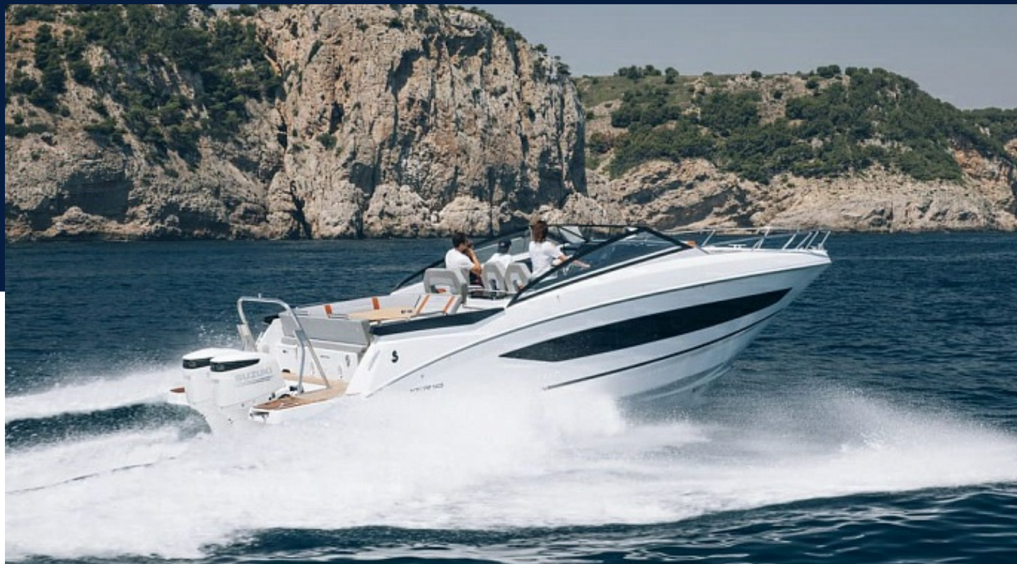
BENETEAU FLYER 10