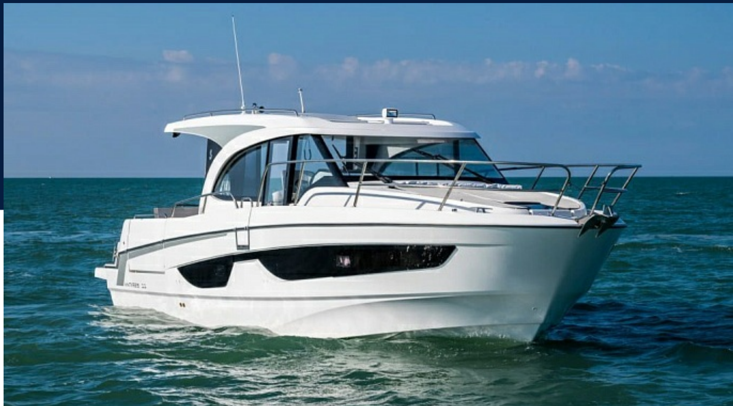
BENETEAU ANTARES 11